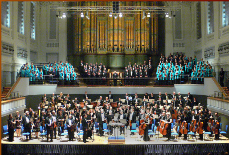
The BPO, with the City of Birmingham Choir and friends, performing Mahler's Resurrection Symphony at Town Hall Birmingham in April 2008.